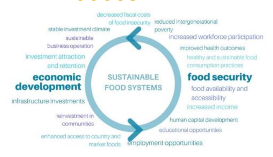
NIEDB Northern Food Systems Recommendations 2019 - Infographic

Northern sustainable food systems are a critical component of economic development in the North. Sustainable food systems support food security, leading to healthier communities, and individuals who are better able to participate in the workforce. With a healthier workforce, the economic climate is more favourable to attract and retain businesses. Improvements in employment, educational opportunities and increased incomes in turn allow for greater food security. Northern sustainable food systems both drive economic development and benefit from the economic growth associated with new business opportunities.