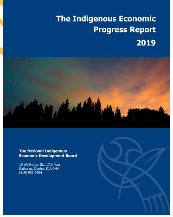
NIEDB Indigenous Economic Progress Report 2019

Released on June 10, 2019, the 2019 Indigenous Economic Progress Report concludes that while the overall economic outcomes for Indigenous Peoples are improving in Canada, this is only to varying and sometimes small degrees. Given the pace of improvements, outcomes were not on track to meet the 2022 targets of economic parity between Indigenous and non-Indigenous people in Canada.